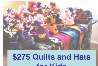
$275 Quilts and Hats for Kids