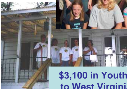
$3,100 in Youth Mission Trips to West Virginia, Michigan, & New Hampshire