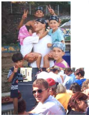
$900 Croatia Mission Trips