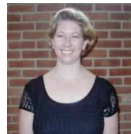
$500 in Seminarian Support