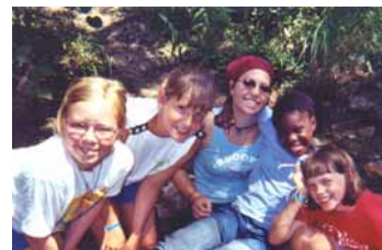
Over $2,500 since 1996 in annual Carlson Camper Scholarships for St Marks Kids