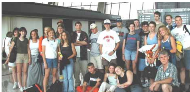
$1,900 Youth Gatherings Support