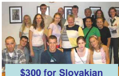
$300 for Slovakian Mission Trip