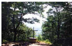
$350 Support to Lutheran Camps