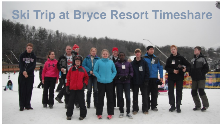
Ski Trip at Bryce Resort Timeshare

"A debt to the past... an obligation to the future... Ensuring the mission of the Church"