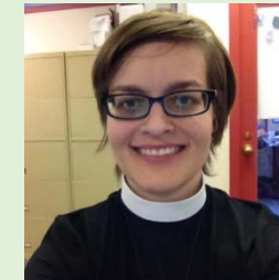
Heidi Eickstadt Seminarian Scholarship