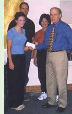
Jackie Stellar Music Scholarship

The vast majority of those who trust in Jesus do so by the age of 18, thus St Michael's focus on youth ministry