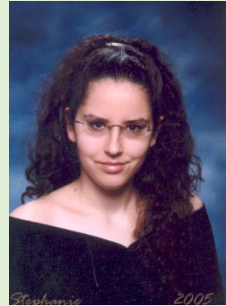
Stephanie Rosholt Lutheran College Scholarship

A major focus of the St Michael's Endowment Fund is promoting calls for the ministry as a career decision thereby fostering and supporting future leadership in the church.