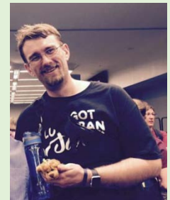
David Essick Seminarian Scholarship

Your Gifts Grow Daily to Nurture Youth in Christ