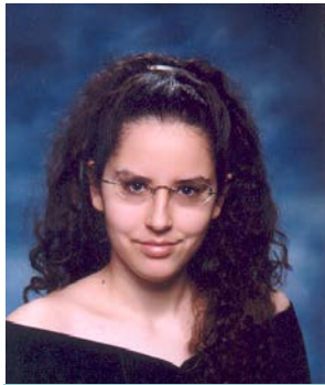
$500 Luther Scholarship