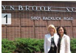
$500 School Supplies