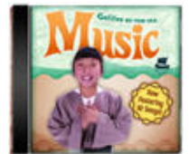
$150 Vacation Bible School