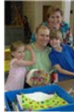
$300 Child Sponsorship