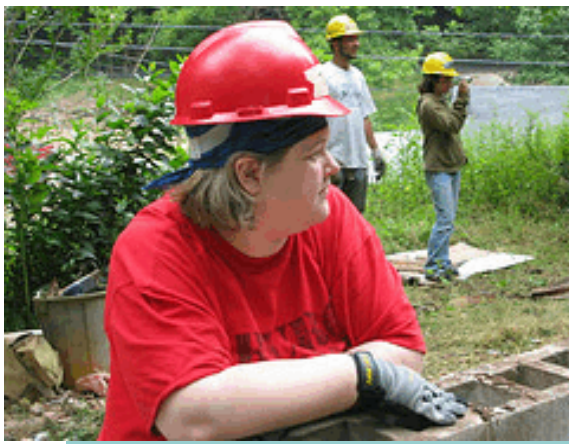
$1,000 Rho Chi Youth Mission Project 2007