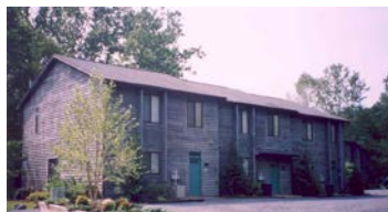
$370 Youth Time Share