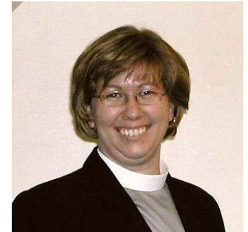
$1,400 in Seminarian Support