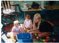
Vacation Bible School