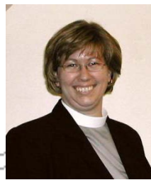
Seminary Graduate 2007