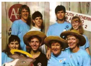
High School Youth Gathering 1988