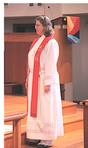
Ordained Pastor 2009