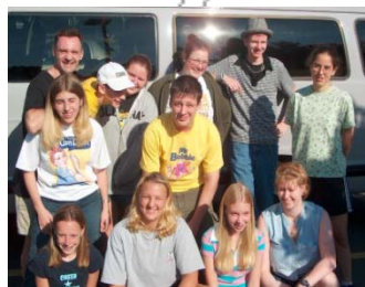
Group Counselor 2002